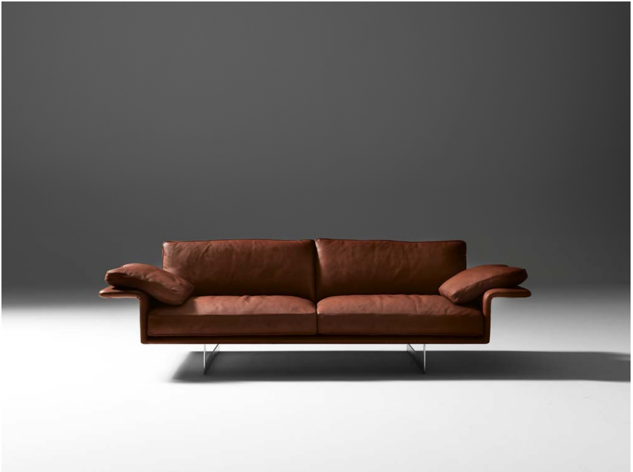
"ALATO" Sofa by Black Tie, Made in Italy