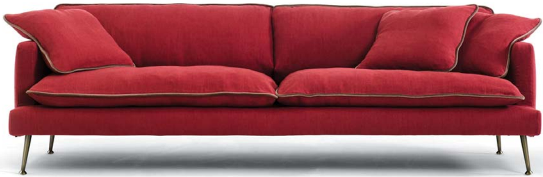
"ISLAND" Sofa by Black Tie, Made in Italy